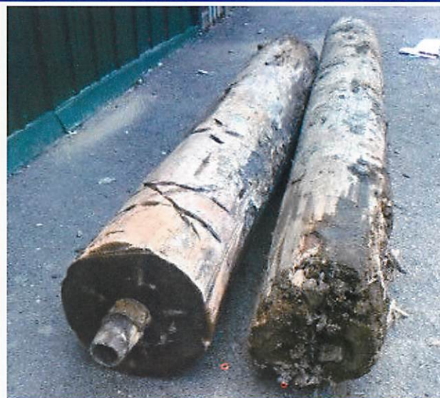
Long-inactive Civil War era wooden pipe discovered during new pipe installation on Hammond Street

We will also complete renovations of our main pump station at Floods Pond. Essentially unchanged in almost 60 years, it will receive four new pumps and pump controllers, relocation of electrical equipment, a new generator, and other renovations to allow partial shutdown of the facility while maintenance is performed.